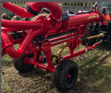
OPTIONAL DUAL PTO